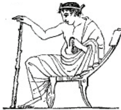
Figure 2: Roman cathedra supina