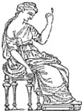
Figure 3: Sella