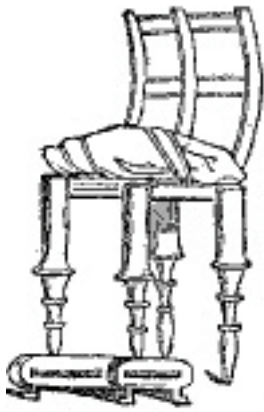
Figure 1: Roman cathedra