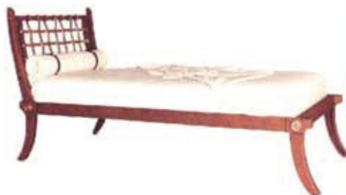
Figure 6: Greek kline